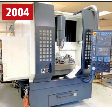
MAKINO SNC64 VERTICAL MACHINING CENTER