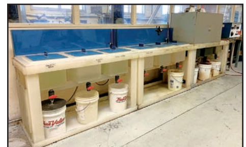
9-STAGE CHROME PLATING LINE

(2) NIKON MEASURESCOPE 10 MICROSCOPES OLYMPUS SZ-10 MICROSCOPE SELECTION OF PIN GAUGES, GAGE BLOCKS, HEIGHT GAGE, HARDNESS TESTER, LARGE ASSORTMENT OF GRANITE SURFACE PLATES AND MORE