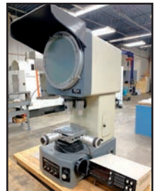
NIKON V-12 PROFILE PROJECTOR