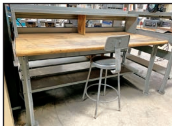
ASSORTED WORK BENCHES