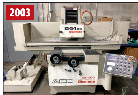
OKAMOTO ACC-1224DX SURFACE GRINDER

(4) MITSUI HIGH-TEC MSG-200MH SURFACE GRINDERS, Sony DRO, Walker Chuck Control