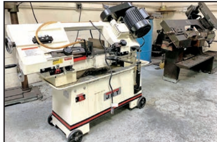
VIEW OF HORIZONTAL BANDSAWS