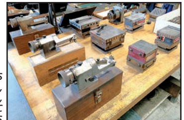
RADIUS DRESSERS, PLATES, MAGNETIC CHUCKS