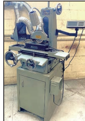
HARIG SUPER 612 SURFACE GRINDERS