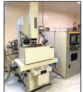
ELOX/FANUC TAPE SINK MODEL A EDM

This sale is a ONE DAY LIVE WEBCAST AUCTION for assets of both R&D Components and Goudie Tool & Engineering. All on-site bidding will take place via theater-style auction that will be conducted from the R&D Components facility at 309 Cary Point Drive, Cary, IL 60013 on February 21, starting at 10:00 AM CT. Both facilities will be open for inspection on February 20.