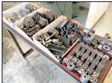
MECTOOL GPS70 SYSTEM 3R TOOLING SYSTEM

This sale is a ONE DAY LIVE WEBCAST AUCTION for assets of both R&D Components and Goudie Tool & Engineering. All on-site bidding will take place via theater-style auction that will be conducted from the R&D Components facility at 309 Cary Point Drive, Cary, IL 60013 on February 21, starting at 10:00 AM CT. Both facilities will be open for inspection on February 20.