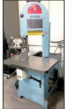
ROLL-IN SAW EF1459 VERTICAL BANDSAW

LARGE SELECTION OF OVER 100 CAT 40 TOOL HOLDERS, TOOLING, TOOL CARTS, 10+ KURT MACHINE VISES, (6) EARTH-CHAIN EEPM-3030 AND EEPM-3040A ELECTRO-PERMANENT MAGNETIC CHUCKS, WORK BENCHES, LYON BALL BEARING CABINETS, GLADIATOR WORK BENCHES, ASSORTED GRANITE SURFACE PLATES, MAGNETIC SINE PLATES, MAGNETIC CHUCKS, ANGLE DRESSERS, RADI-DRESSERS, GRIND-ALLS, SHOP FANS, SHOP CABINET AND MORE