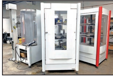
EROWA ERS ROBOTIC LOADING SYSTEM