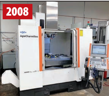
AGIE CHARMILLES MIKRON VCE1000 PRO-X VERTICAL MACHINING CENTER