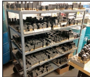
HUGE SELECTION OF EROWA EDM TOOLING