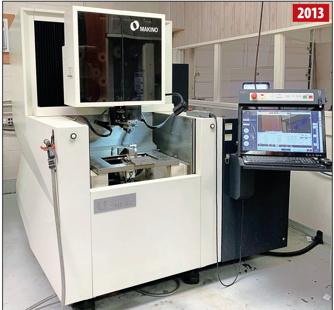
MAKINO U3 H.E.A.T. WIRE EDM

FEATURING: ELECTRICAL DISCHARGE MACHINES, VERTICAL MACHINING CENTERS, ROBOTIC LOADING SYSTEM, SURFACE GRINDERS, TOOL ROOM, INSPECTION & FACTORY SUPPORT