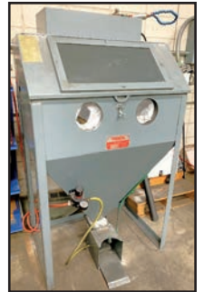
TRINCO 36/BP DRY BLAST CABINET