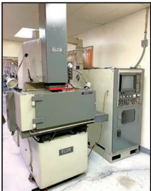
ELOX HERITAGE 8 SINKER EDM