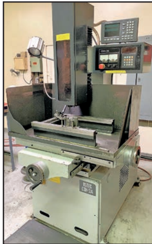
ASTECCD H-3A HOLE POPPER EDM