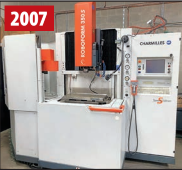
CHARMILLES ROBOFORM 350S EDM

All on-site bidding will take place via theater-style auction that will be conducted from the R&D Components Facility in Cary, Illinois