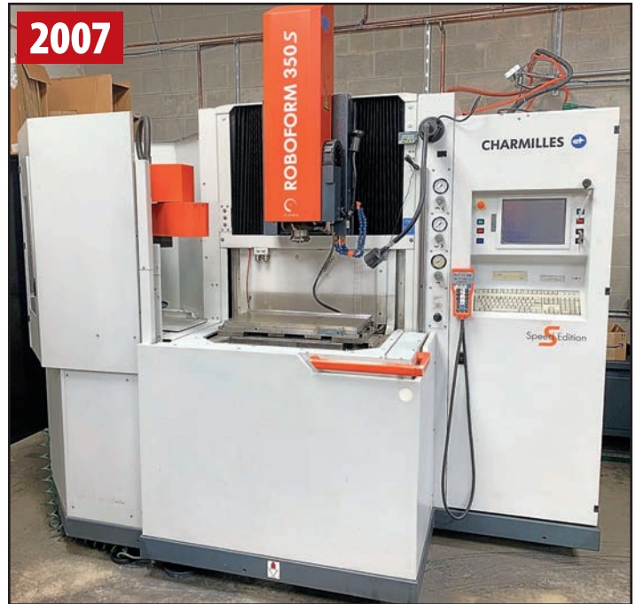
CHARMILLES ROBOFORM 350S EDM