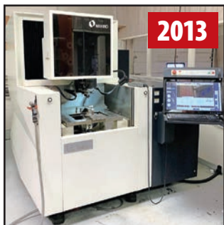
2013 MAKINO U3 H.E.A.T. WIRE EDM

Featuring: Electrical Discharge Machines, Vertical Machining Centers, Robotic Loading System, Surface Grinders, Tool Room, Inspection & Factory Support