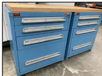
LYON BALL BEARING CABINETS