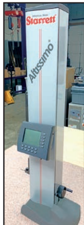
STARRETT ALTISSIMO ELECTRONIC HEIGHT GAGE