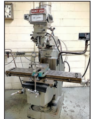
KENT 3VKH VERTICAL MILL