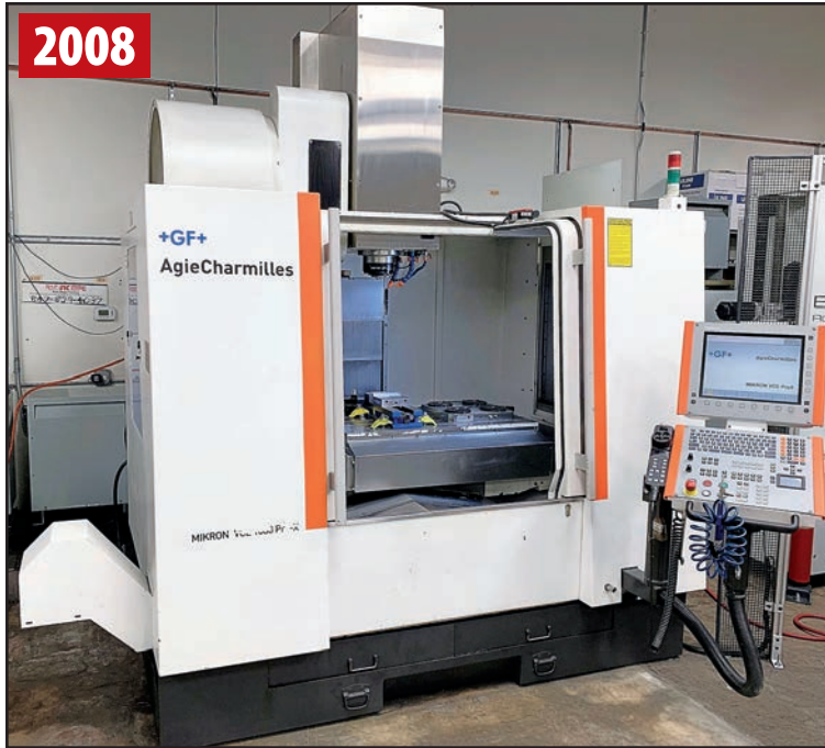
AGIE CHARMILLES MIKRON VCE1000 PRO-X VERTICAL MACHINING CENTER